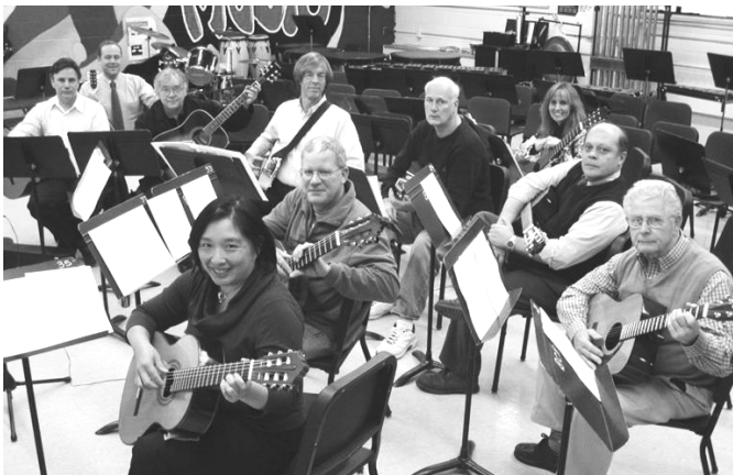
NJGMS Guitar Ensemble Session. November, 2009